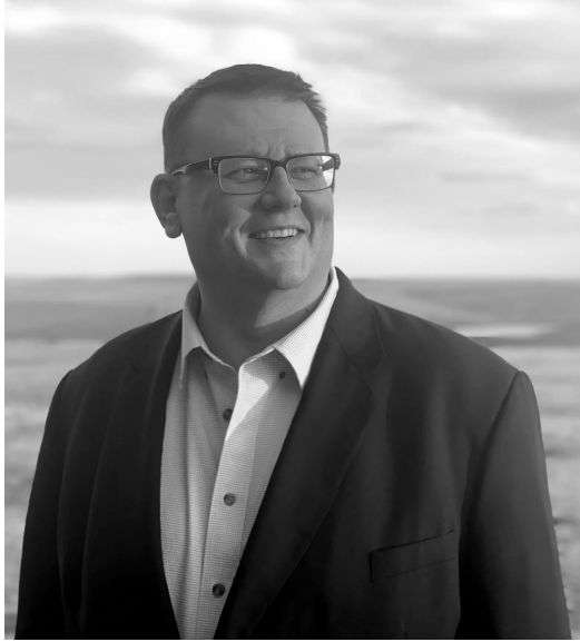
COMMISSIONER Brock L. Greenfield