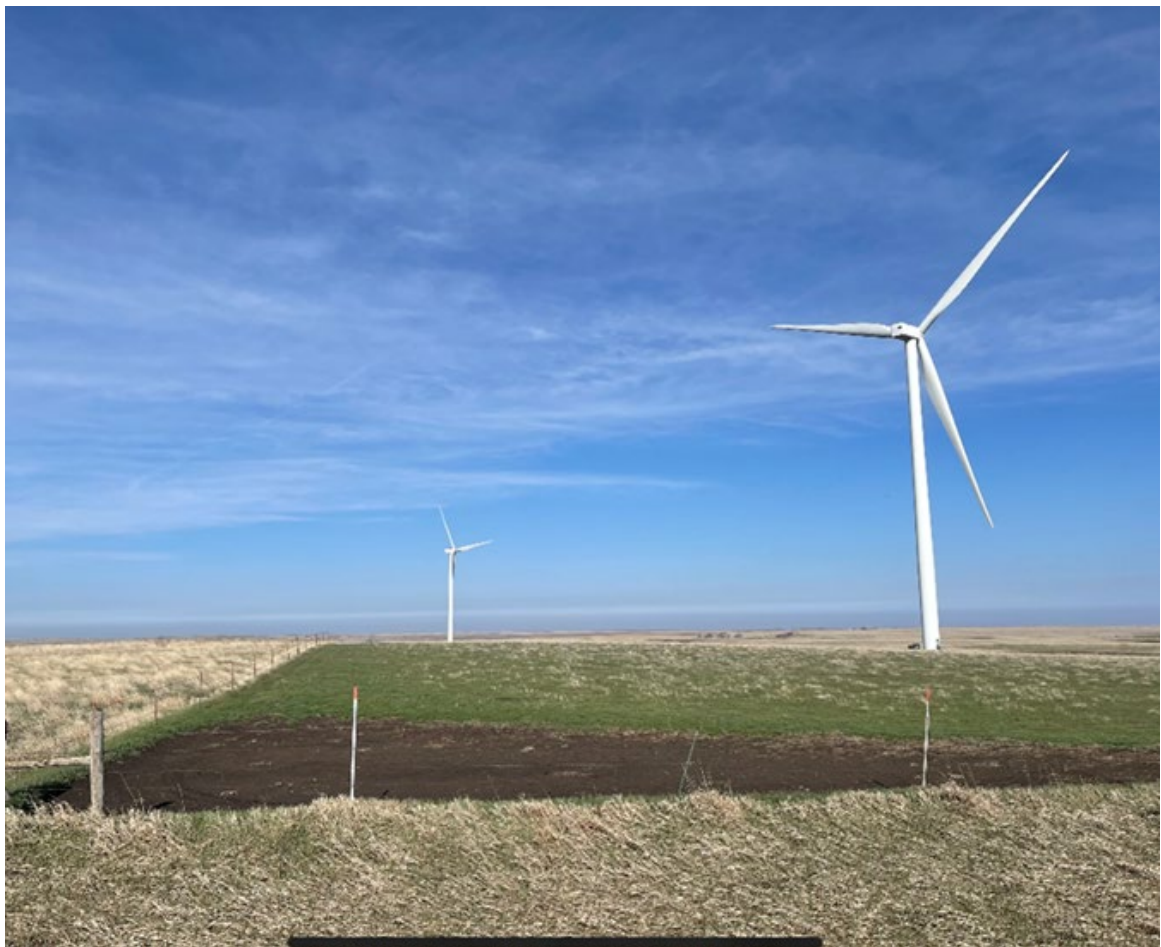
The first wind turbines on SD School and Public Lands in Hyde County