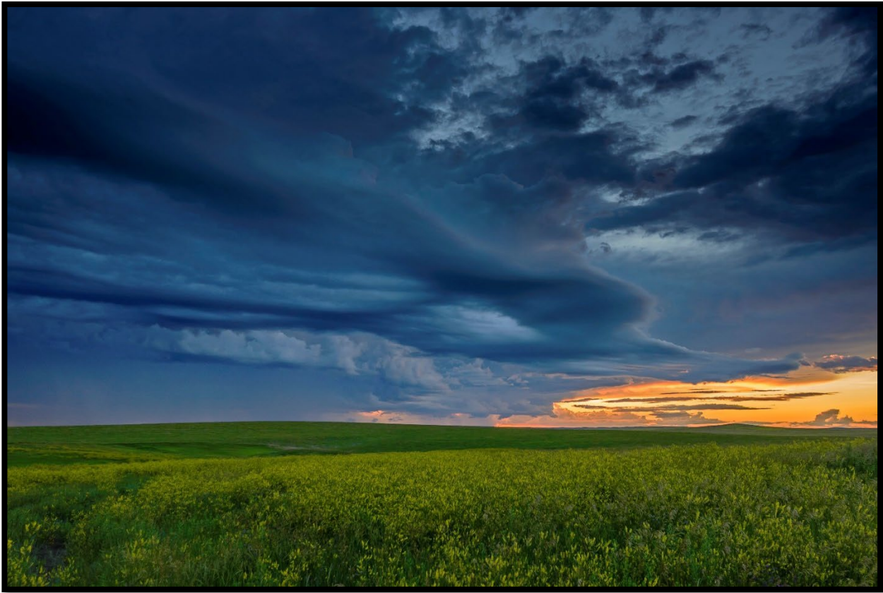
Back Cover

500 East Capitol Avenue Pierre, SD 57501 Phone: 605.773.3303 www.sdpubliclands.sd.gov