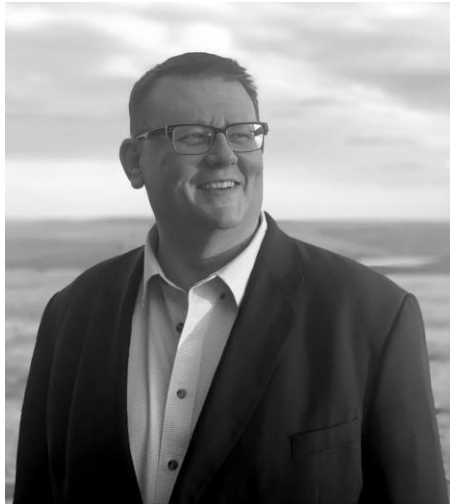
COMMISSIONER Brock L. Greenfield